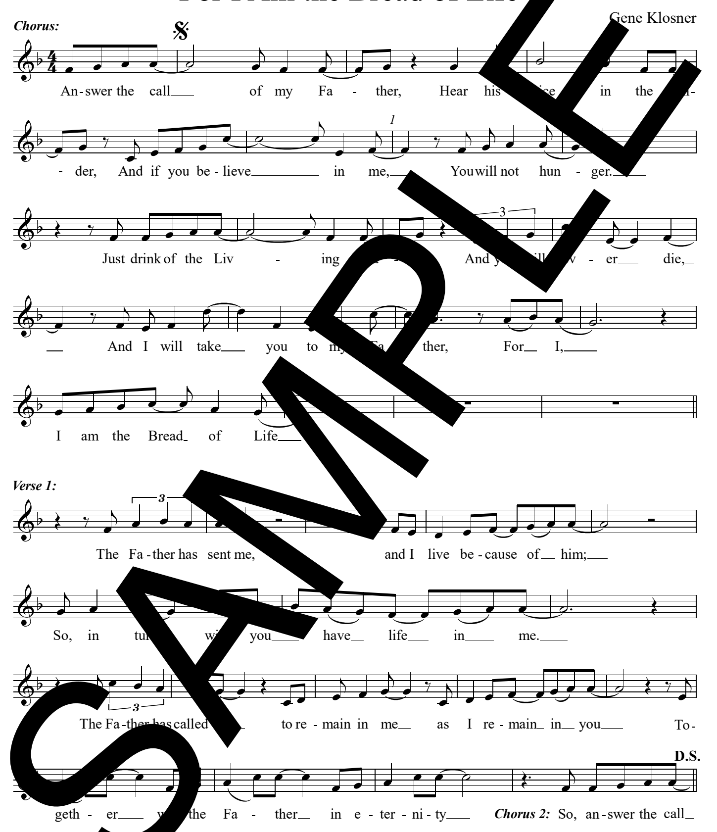
Copyright © 2002 Light the Fire! Music (ASCAP). www.LTFMusic.com