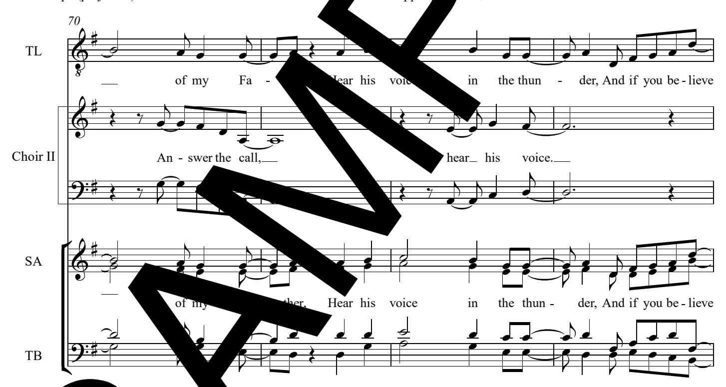
II is a descant for larger choir o can cover an extra SATB

Handclaps (preferred) or drum beat on beats 2 and 4 start to e on a cappelle action, and continue to the end