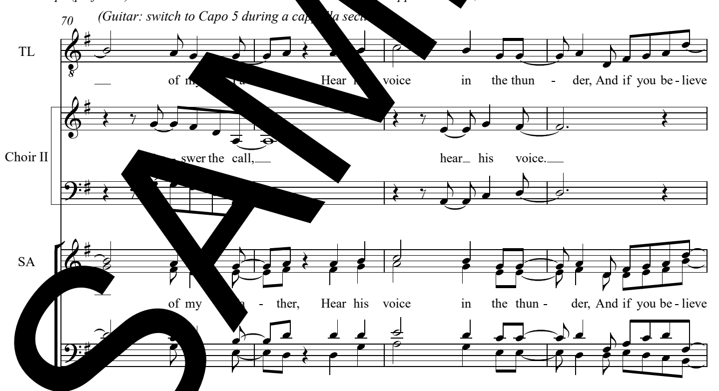
Choir II is a degree of form of choirs, who can cover an extra SATB

Handclaps (preferred) or drum beat on beats 2 and with a cappella seem, and continue to the end