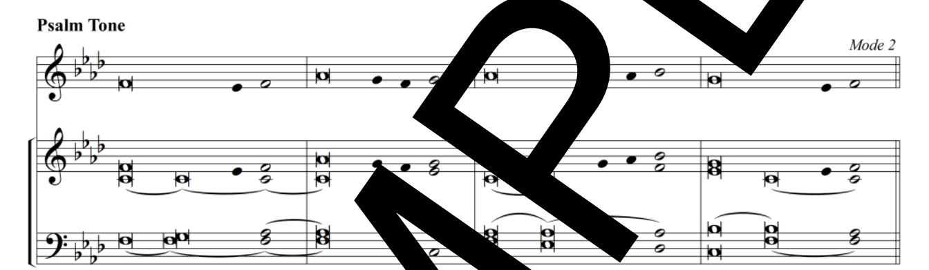
Psalm 91:1-2, 10-11, 12-13, 14-15. R/cf. v. 15b