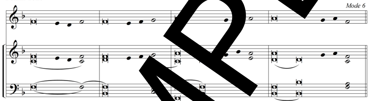
Psalm 78:3-4, 23-24, 25, 54. R/v. 24b