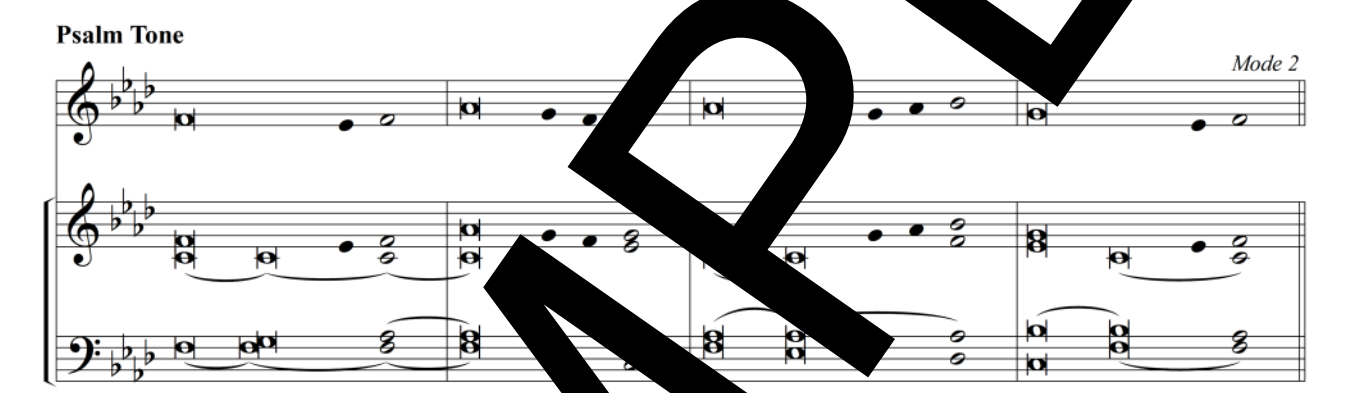
Psalm 78:1bc-2, 34-35, 36-37, 38. R/see v. 7b