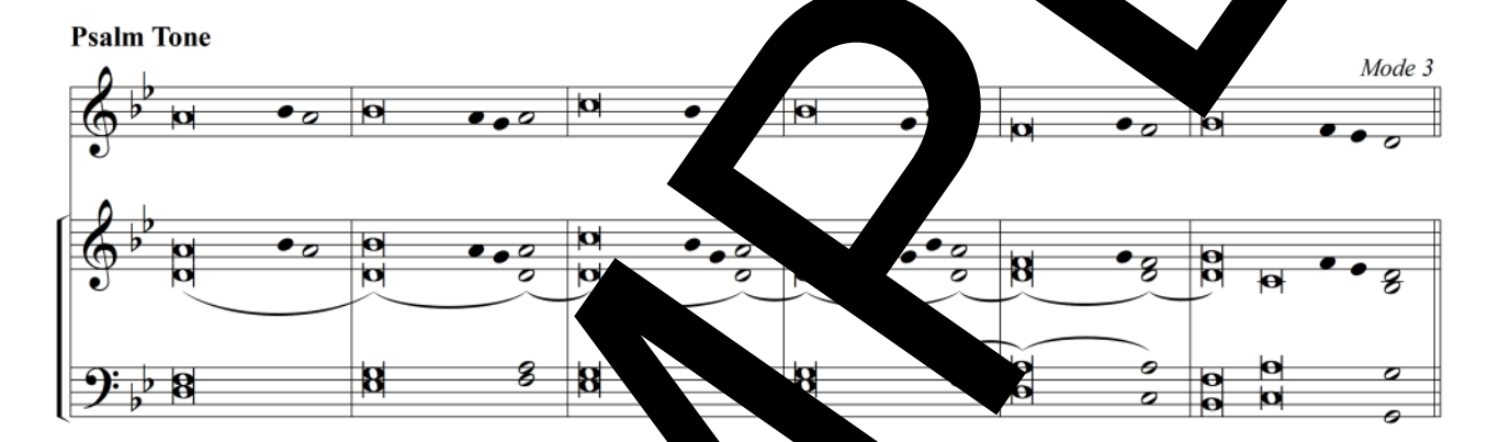
Psalm 69:8-10, 14, 17, 33-35. R/v. 14c