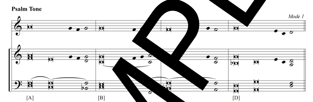
Psalm 65:10, 11, 12-13, 14, R/Lk 8:8