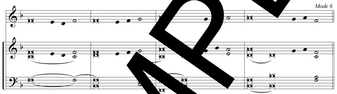
Psalm 29:1-2, 3-4, 3, 9-10. R/v. 11