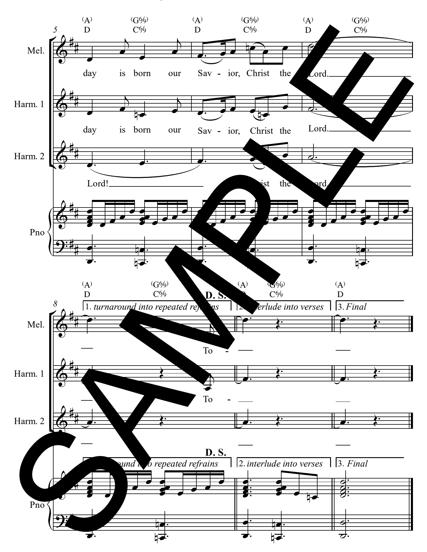
Verse chords (Psalm Tone 14/15), Piano/Guitar, no capo:

D | Am7 | Gadd9 | Dadd9 | Em7sus4 | Dadd9/F# | Gadd9 | A7sus4 |