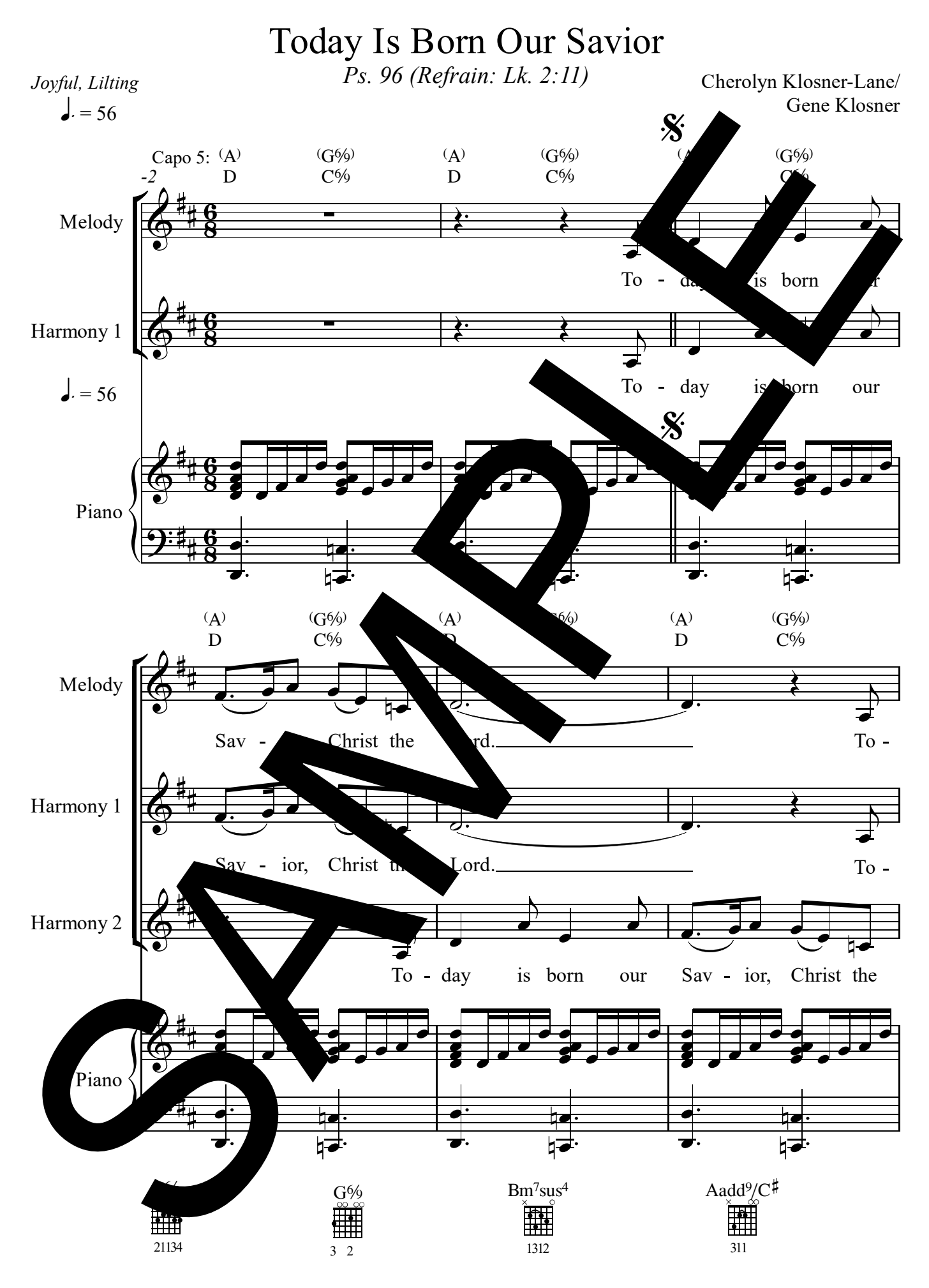
The English translation of Psalm Response from Lectionary for Mass © 1969, 1981, 1997, International Commission on English in the Liturgy Corporation. All rights reserved. Music: Copyright © 2005 Light the Fire! Music (ASCAP). All rights reserved. Used with permission. www.LightTheFireMusic.com Report usage to CCLI/OneLicense.